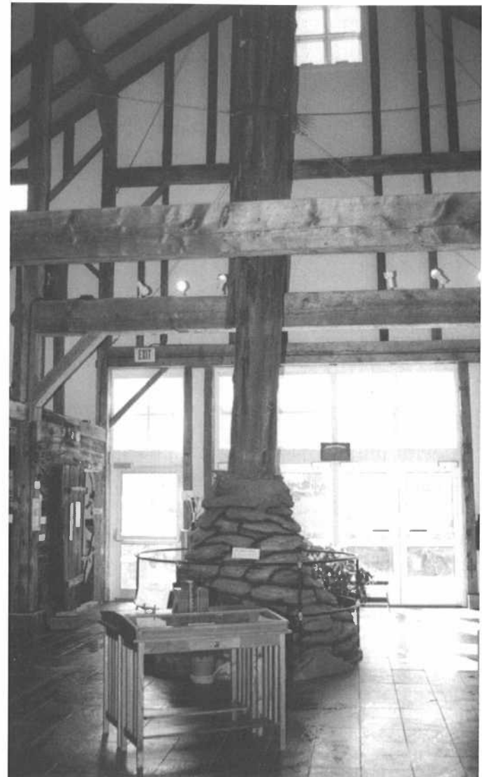
The base of the museum's replica quarry stick, encased in slate. Real sticks stood as tall as 90 feet.