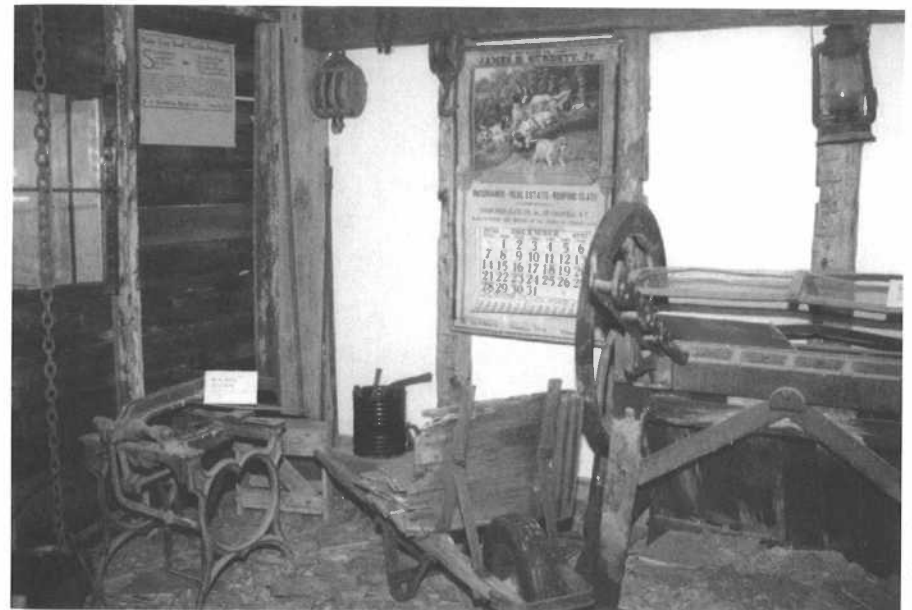
Slate Valley Museum

them are owned by descendants of immigrants from eastern Europe, who came to the Valley about 100 years ago. Other descendants of slate workers have also remained in the Valley. Their cultures have become an important part of Valley life.