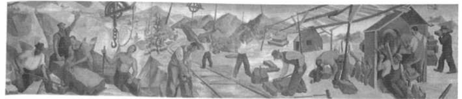
Slate Valley Museum

The slate industry is still one of the largest employers in the Slate Valley. Almost forty slate companies remain in operation. Several of