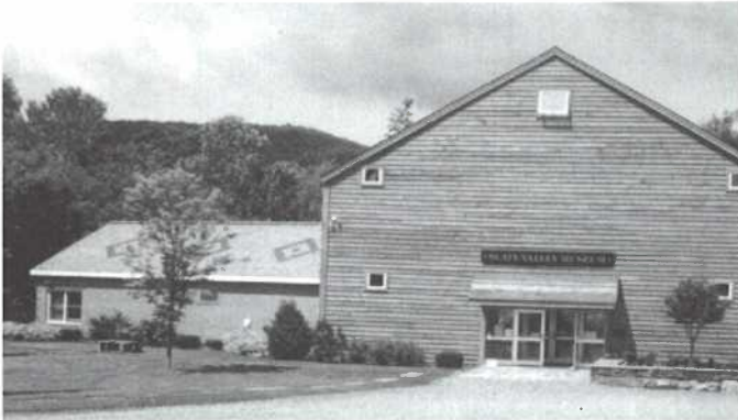
Slate Valley Museum

If you can't get there in person, the museum web site shows many of the exhibits. It even has recipes! You can visit the website at: http://www.slatevalleymuseum.org .