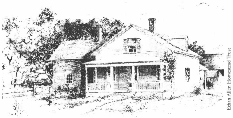
Ethan Allen Homestead Trust